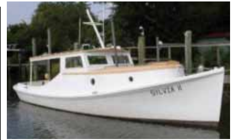
The Sylvia II was gifted along with property.