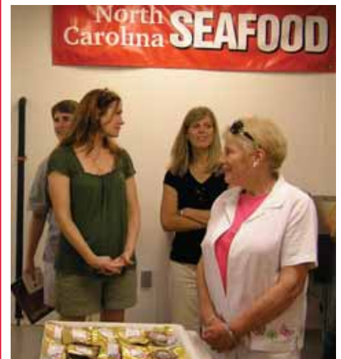
Congressional staff visit the Seafood Laboratory Pilot Plant to hear about traceability and sample a smoked trout aquaculture product from NC..