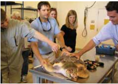
Staffers view loggerhead turtle up close.