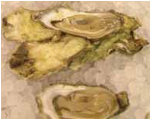
Oysters await testing in toxicology lab.