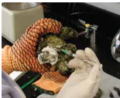
Samples being taken from oyster.